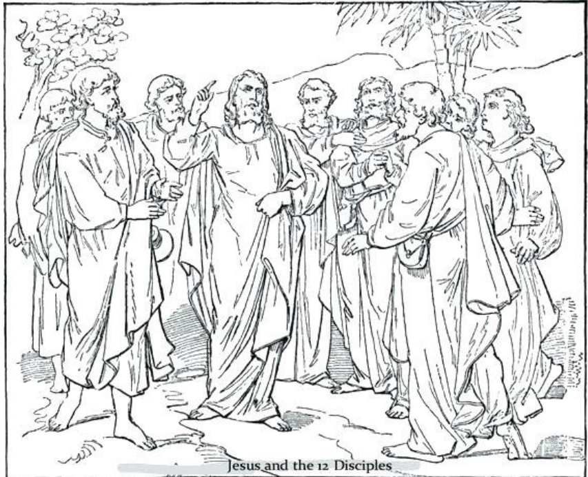
Jesus and the 12 Disciples